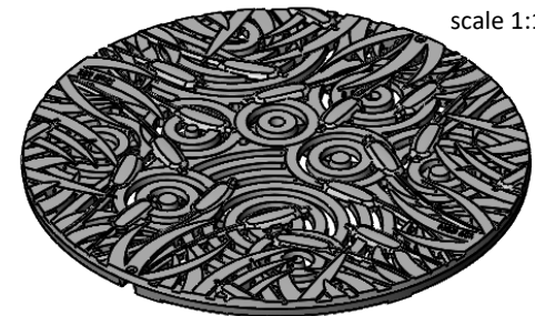
Perspective scale 1:10